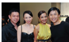
Opening of Porsche Design Store at Marina Bay Sands